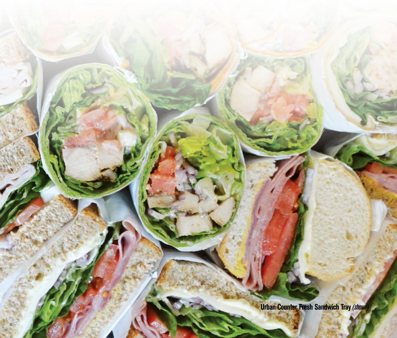
Urban Counter Fresh Sandwich Tray (shown)